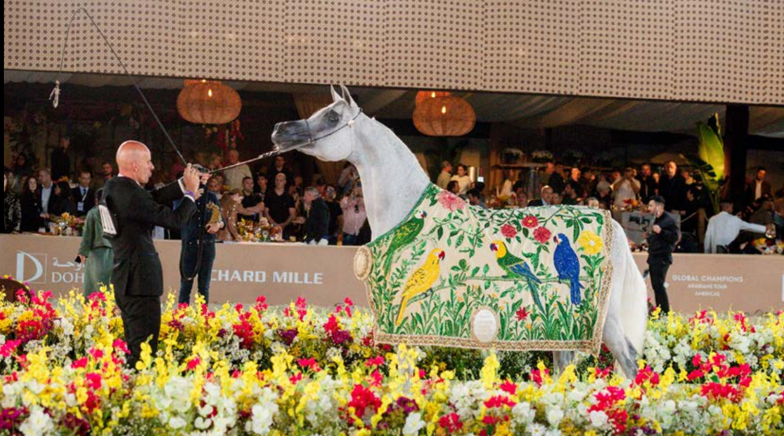
SEPHORA K ( Paris K x Sienna Carol ) GOLD CHAMPION SENIOR MARES - GCAT AMERICAS SAO PAULO 2025