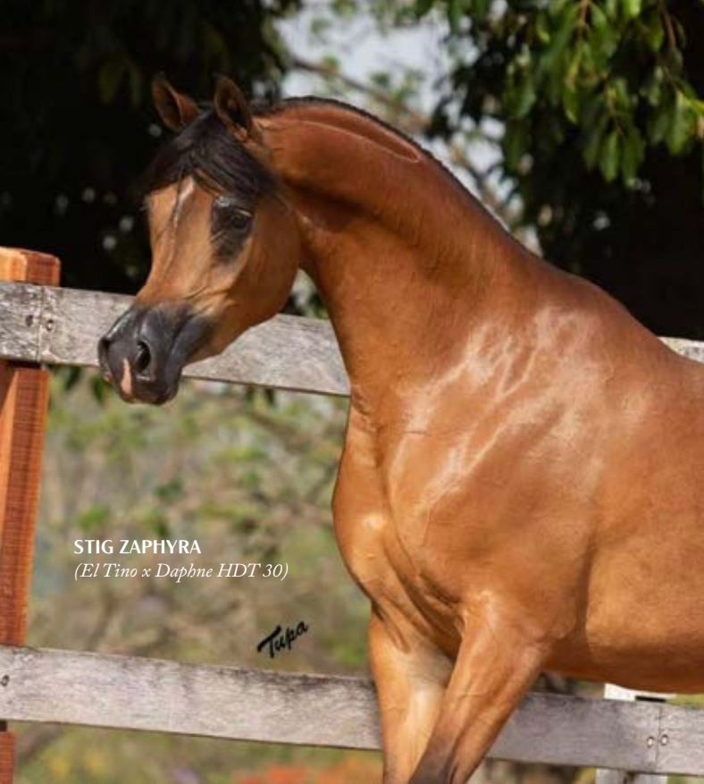
STIG ZAPHYRA ( El Tino x Daphne HDT 30 )