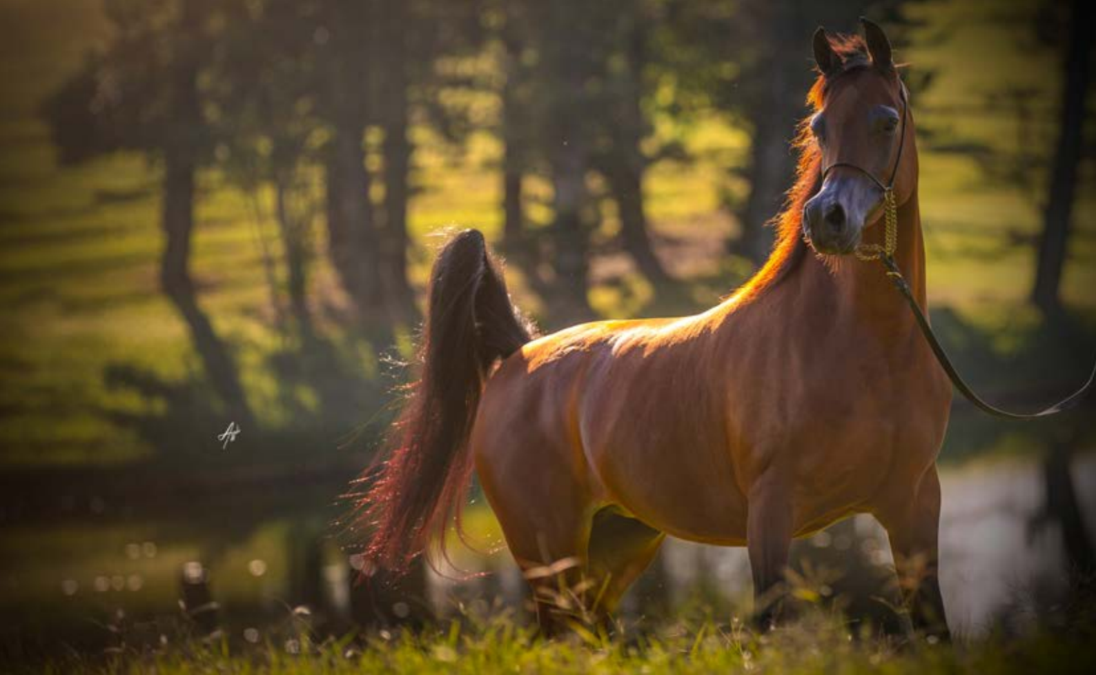
PREFERIDA RACH ( Bandit SRA x Persephone Rach ). 7X BRAZILIAN NATIONAL CHAMPION