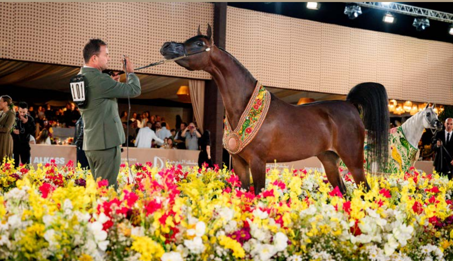
CARANDA LULIKAH ( Bandit SRA x Sahara Latifa ) BRONZE CHAMPION SENIOR MARES - GCAT AMERICAS SAO PAULO 2025 CHAMPION YOUNG MARE BRAZILIAN NATIONAL 2024