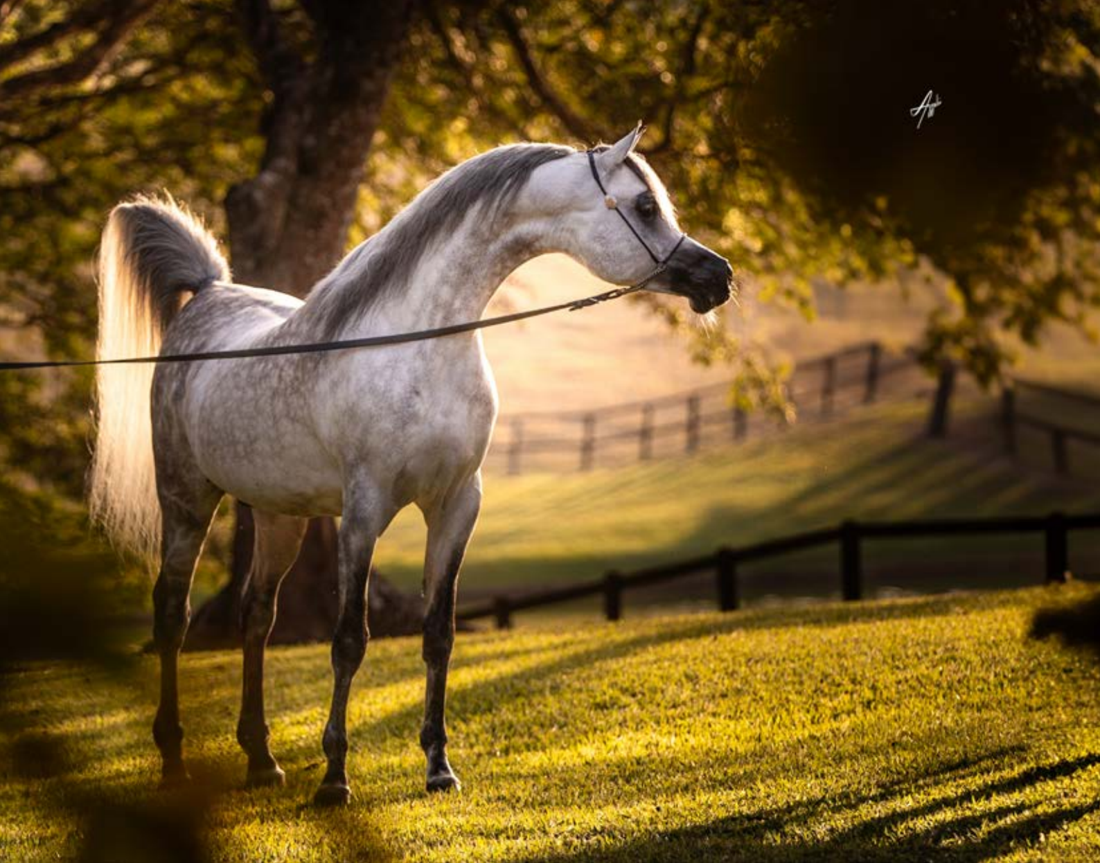
JYTAN MEIA LUA ( El Jabez WH x Jyvara El Maktub by RFI Maktub )