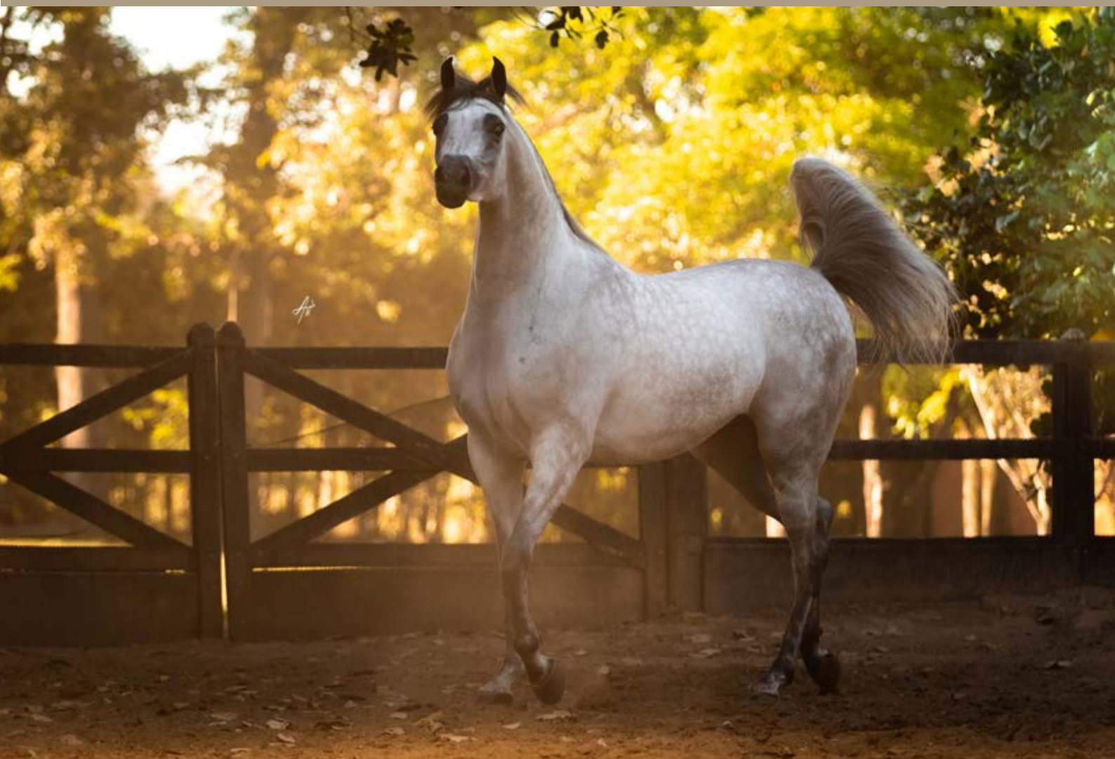
JYVADORA EMV ( Jyvar Meia Lua x FT Pandora )

two full siblings by Jahez and Jyvara, both outstanding sires, the bay Jyvar Meia Lua and the grey Jytan Meia Lua. A full sister to Jyvara, the white beauty Jioya Meia Lua is now part of the broodmare band at TP Arabians as well as the beautiful daughter of Jyvar Meia Lua, Jyvadora EMV.