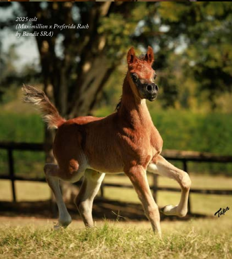
2025 colt (Maximillion x Preferida Rach by Bandit SR4)