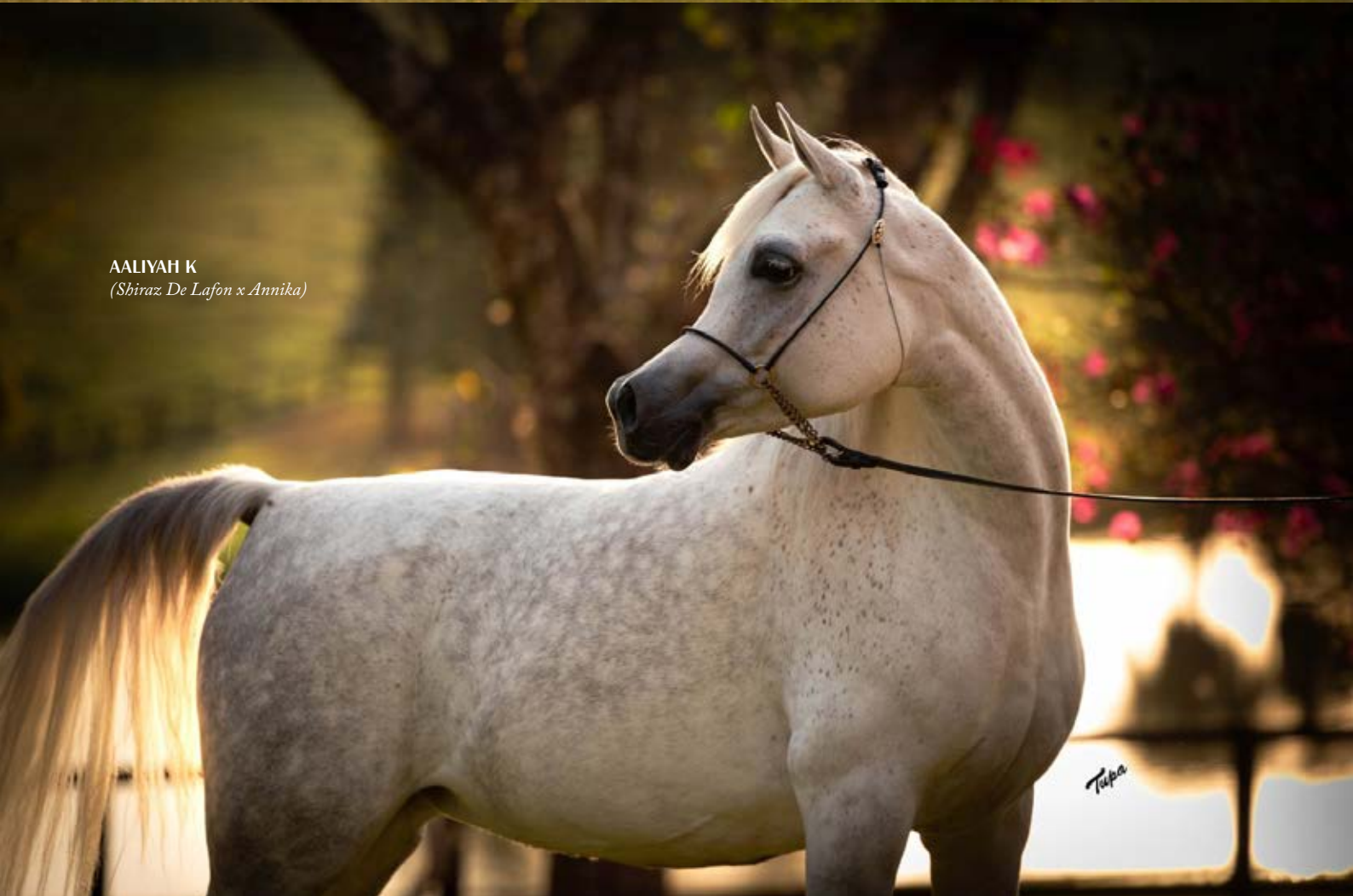
AALIYAH K (Shiraz De Lafon x Annika)