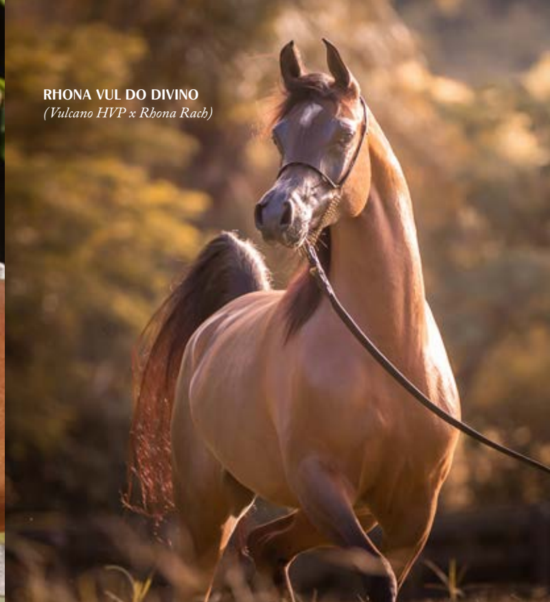
RHONA VUL DO DIVINO ( Vulcano HVP x Rhona Rach )

member of the distinguished family of the aristocrat NV Tiara Bey mother of another aristocrat, Jamaara FA, and the U.S. National Champion Yearling Colt Psytanium.