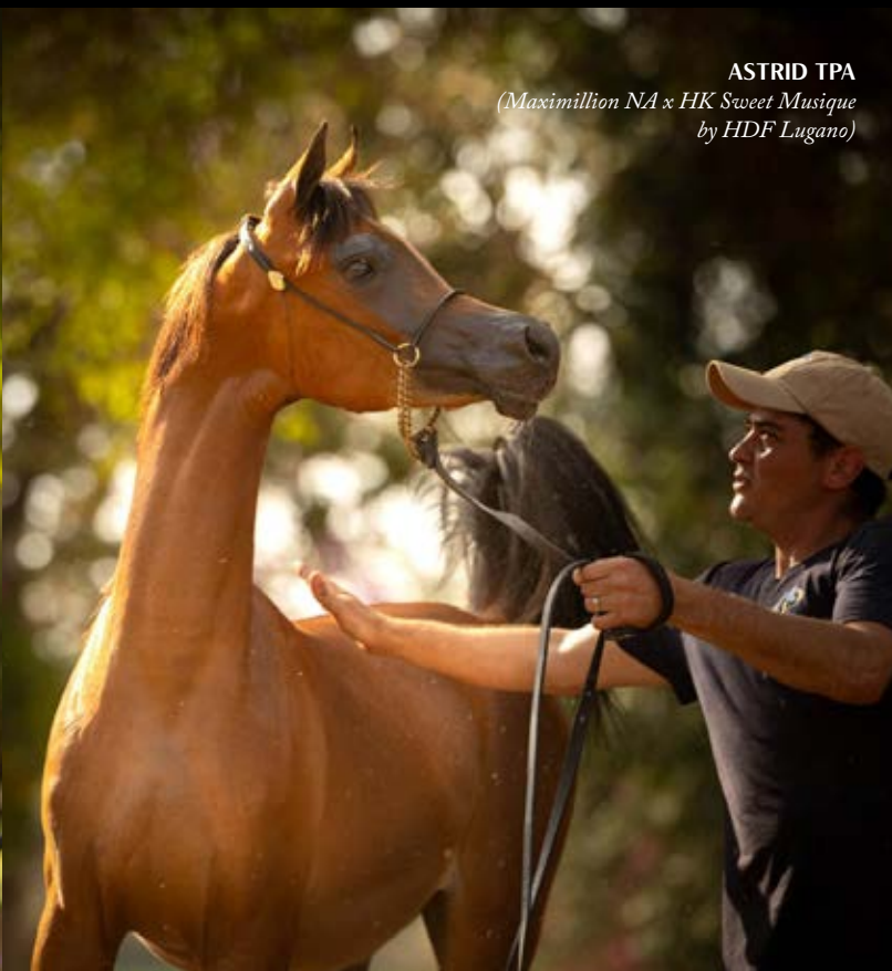
ASTRID TPA (Maximillion NA x HK Sweet Musique by HDF Lugano)