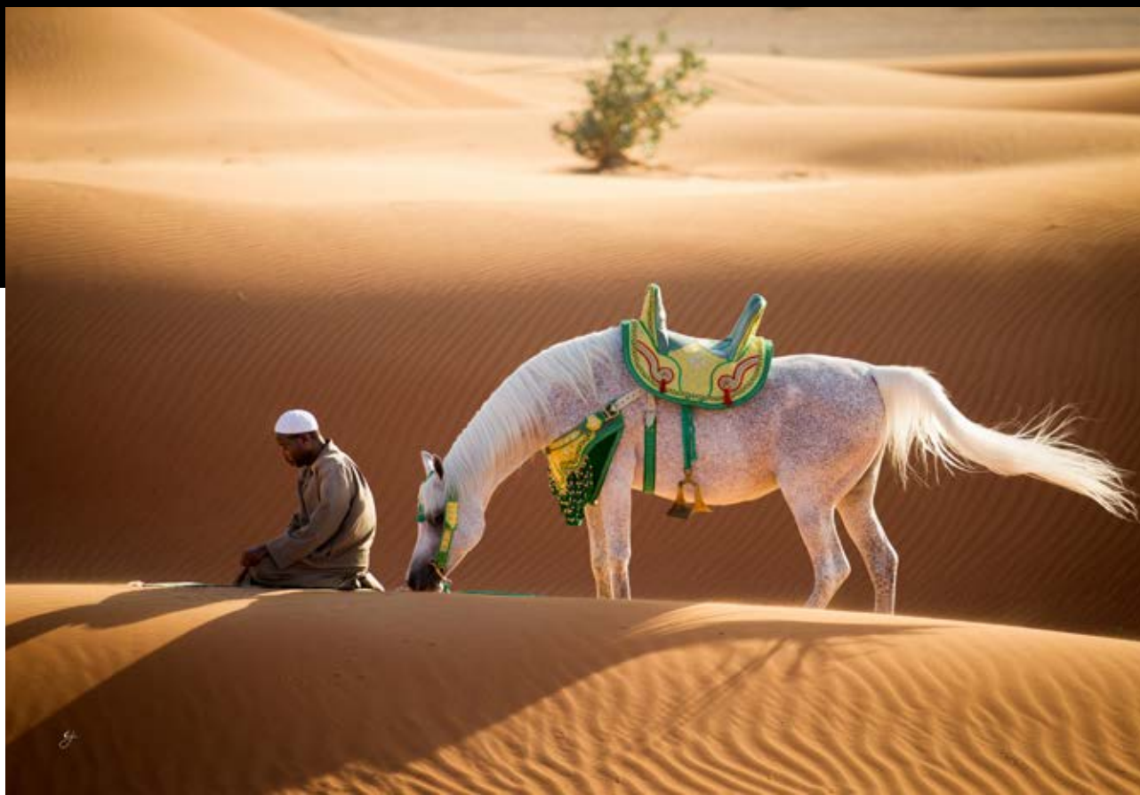
HW EGYPTIAN ART ( El Shaklan x Hal Sheeba NA by Hal Gibby)

winning the National Champion Stallion title with him, against all the odds, leaving behind all the favorites contenders for the title. Dyorchall HCF was later exported to Europe where he served as a sire and won several shows.