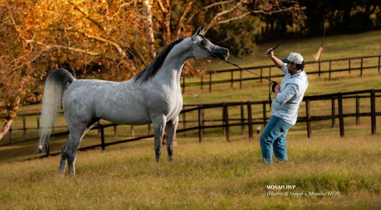
MONAH HVP (Hariry Al Shaqab x Monalisa HVP)