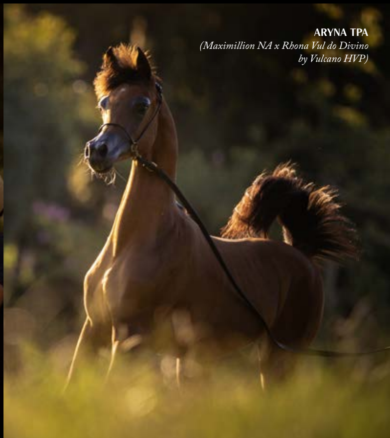
ARYNA TPA (Maximillion NA x Rhona Val do Divino by Vulcano HVP)